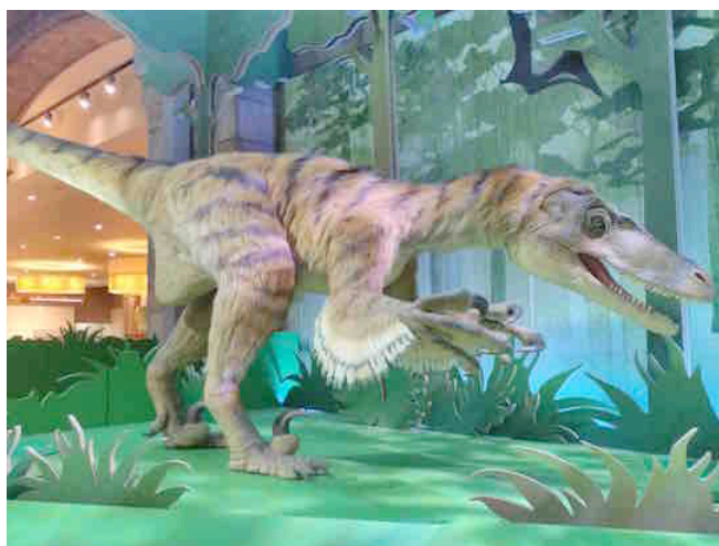
Deinonychus antirrhopus in the Natural History Museum - where did the feathers come from?